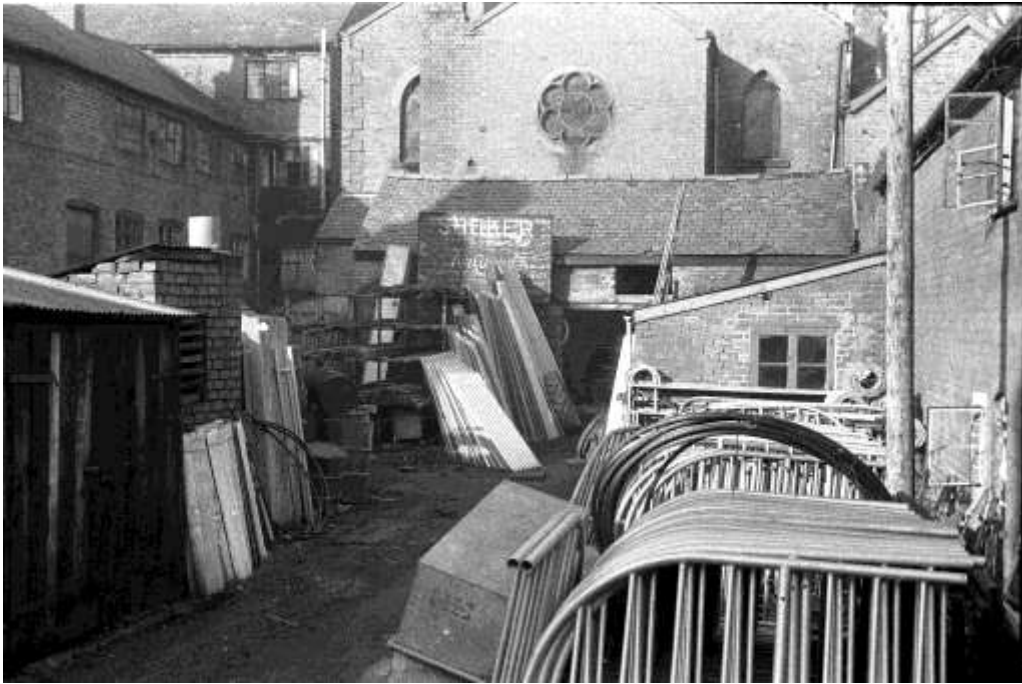
Shukers first depot on the site of what was Ladywell House.